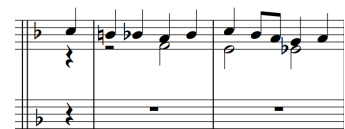
Toccata 3 b.21