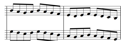
Toccata 7 b.34-35