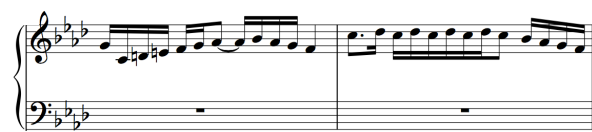
Toccata 1 b.81-82